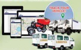
GPS VEHICLE TRACKING & FLEET MANAGEMENT SYSTEM