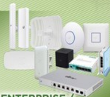
WIFI ENTERPRISE / NETWORKING / WIRELESS BROADBAND