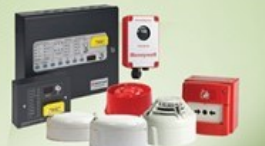
FIRE DETECTION & ALARM SYSTEM